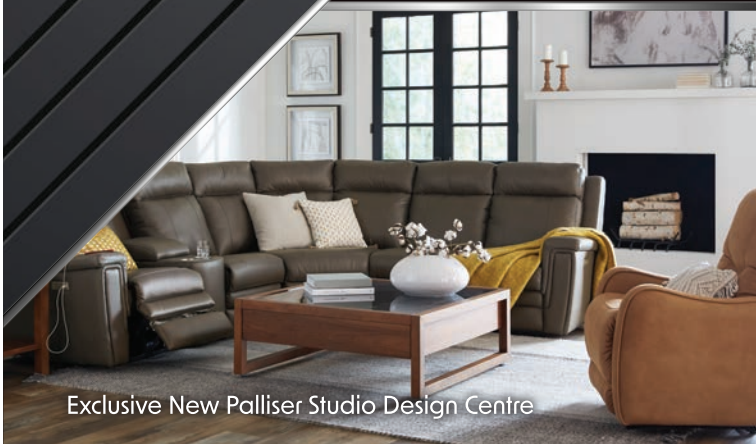
Exclusive New Palliser Studio Design Centre

Celebrate 70 Years of Comfort and Unbeatable Deals!